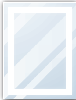
4 Side Inset