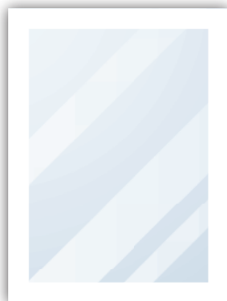
4 Side Halo